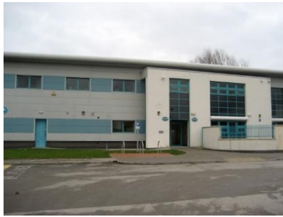
Foundation Dentist Surgery