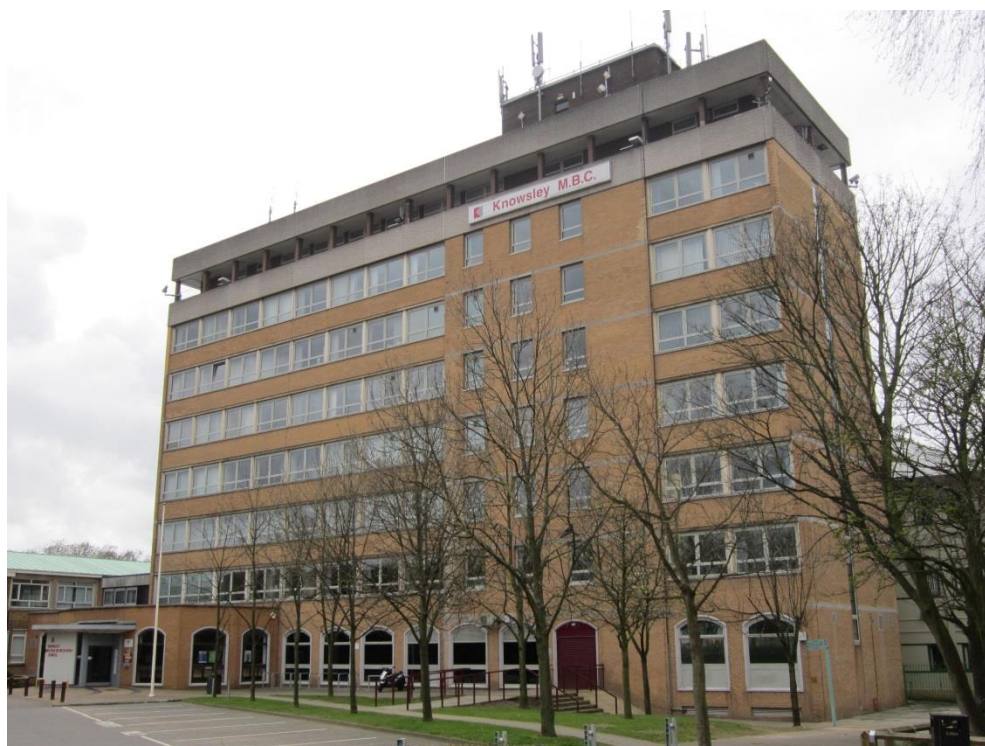
Knowsley Metropolitan Borough Council Municipal Building in Huyton