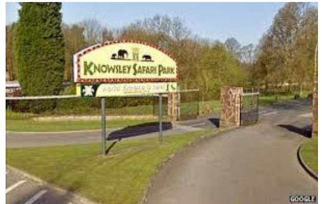
Knowsley Safari Park