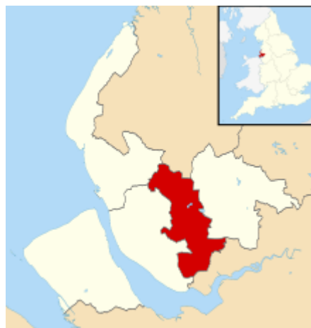
Map of Knowsley